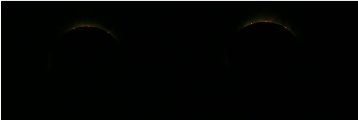
08:36:11 UT (Contact III)